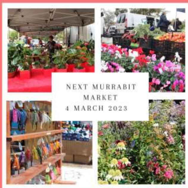
NEXT MURRABIT MARKET 4 MARCH 2023