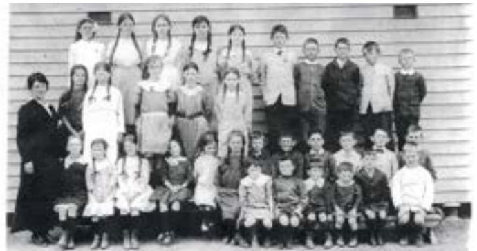
Myall State School 1915