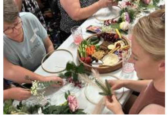
Pictured right and below - Christmas Wreath Making Workshop

Thanks to the Gannawarra Shire Council's Flood Recovery program for funding this event for our community. We will have more exciting events to plan in 2024.