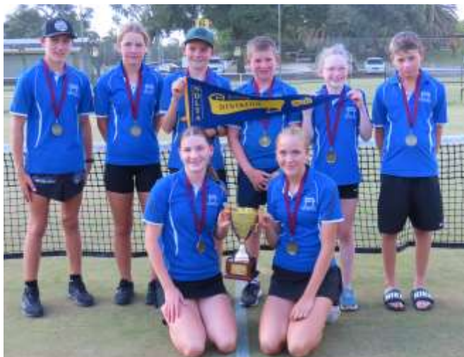
Murrabit Tennis Club Junior 2024 Premiership team