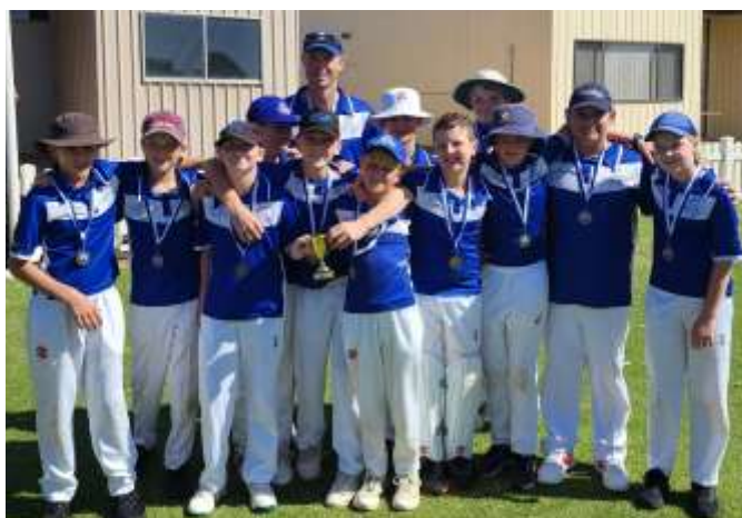
Murrabit Cricket Club U13 2024 Premiership team

Congratulations to all the young people in our district who have won their respective grand finals in the past few weeks in their chosen sports. We have had champions in cricket, tennis and basketball. Isn't it great to see that we have so many young people keeping our sporting clubs alive. Pictured below is the U13 2024 Murrabit Premiership team and Junior Murrabit Tennis Club Premiers. WELL DONE!