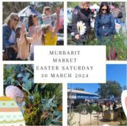
MURRABIT MARKET EASTER SATURDAY 30 MARCH 2024